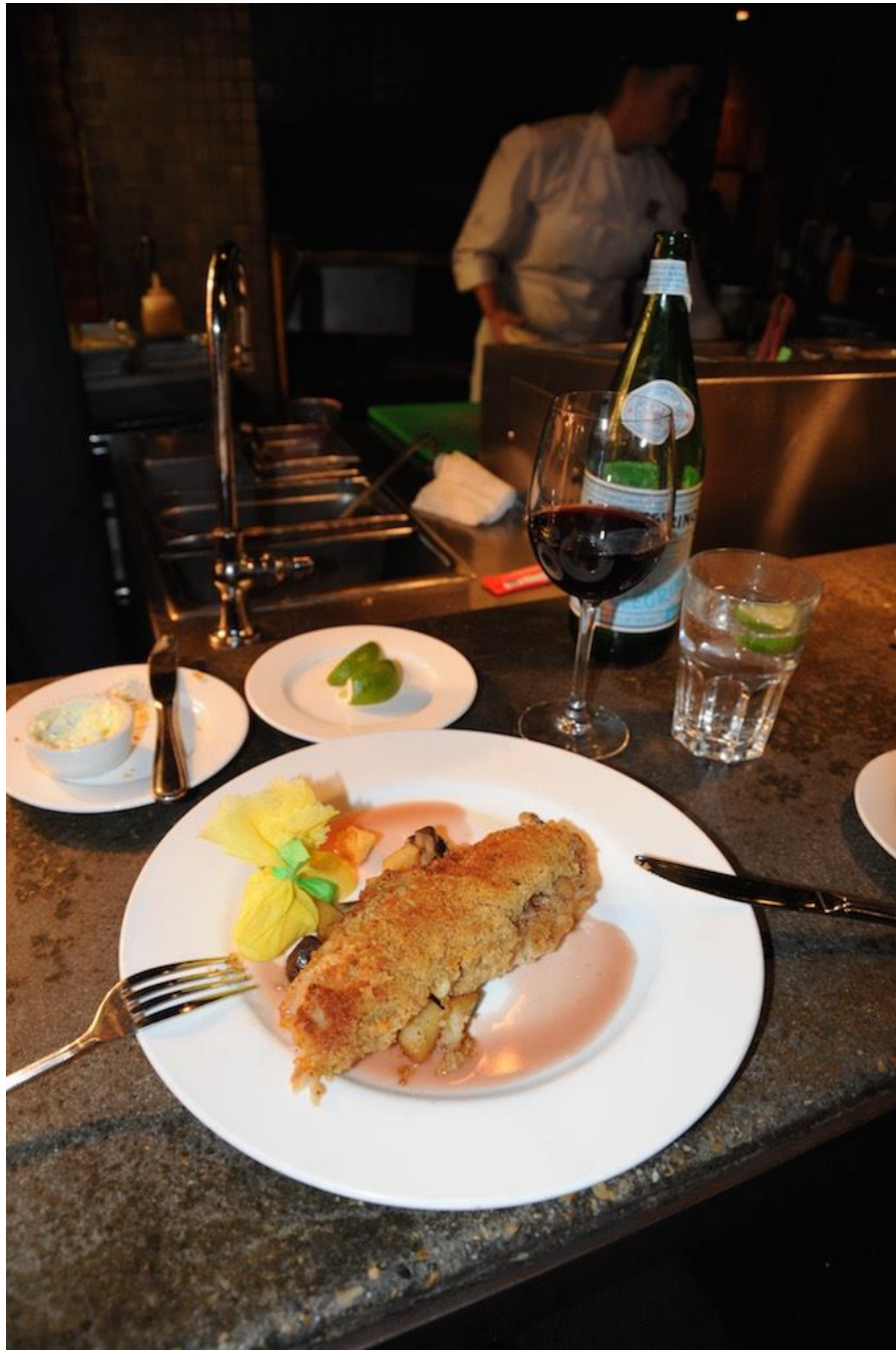
The essence of New Orleans

*****Meet our newest ABAT Diplomats in the Spring Newsletter *****