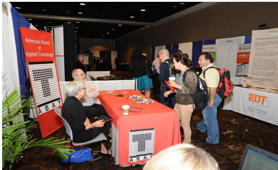
Booth Volunteers in Action in 2014!!